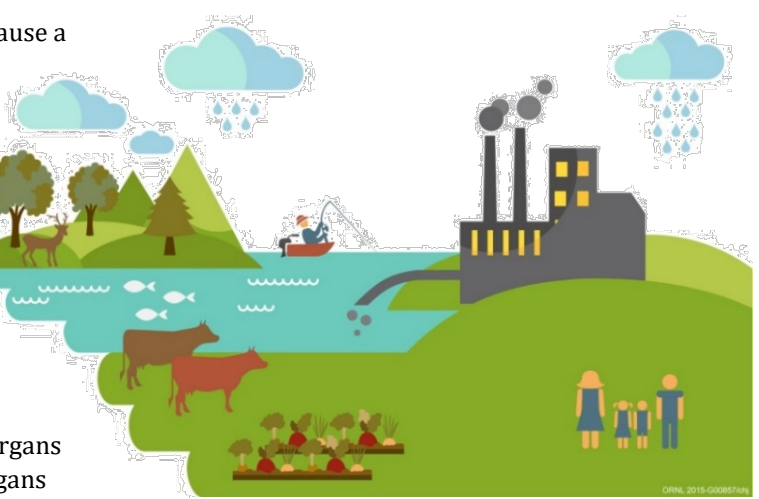
Figure E.2. Examples of radiation pathways

People can be exposed to radionuclides in the environment through a number of routes, as shown in Figure E.2. Potential routes for internal and external exposure are referred to as pathways. For example, radionuclides in air could be inhaled directly or could fall on grass in a pasture. If the grass were then consumed by cows, it would be possible for the radionuclides to impact the cow's milk, and subsequently the people drinking the milk. Similarly, radionuclides in water could be ingested by fish, and fishermen or other consumers could then ingest the radionuclides in the fish tissue. People swimming in the water also would be exposed. Exposure to ionizing radiation varies significantly with geographic location, diet, drinking water source, and building construction.